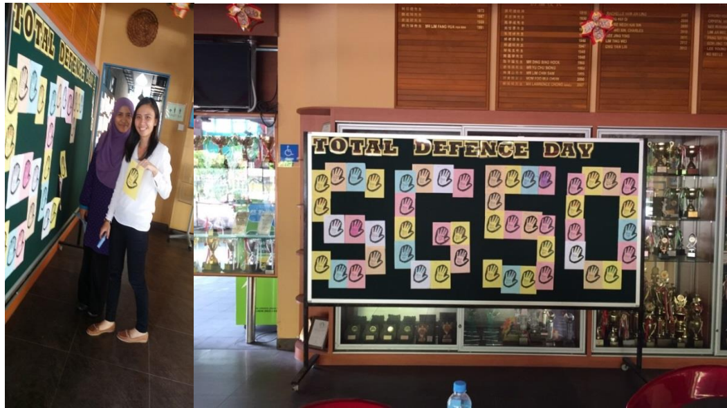
Not forgetting our community, our P5 students participated in TDD Commemoration 2015 @Junyuan Secondary with NS Officers [1 SIR unit].